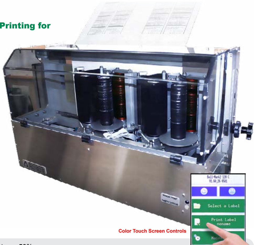
Color Touch Screen Controls