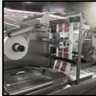
Mounted on an HFFS packaging machine