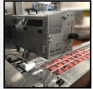
Mounted on a HFFS food packaging line