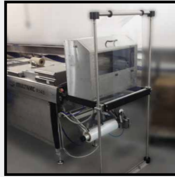
MLP printing on bottom web