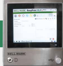
Advanced, IP-67 rated, 10.4" (264 mm) HMI