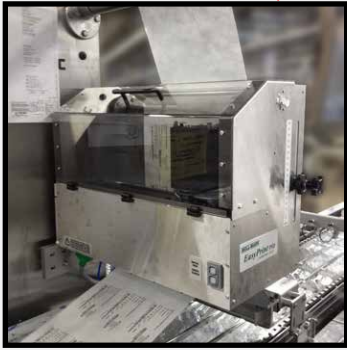
Mounted on a HFFS medical device packaging line