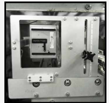
Mounted on a Vertical Bagger