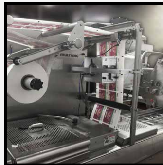
Mounted on an HFFS packaging machine