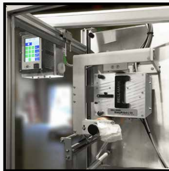
Mounted on a Continuous flow wrapper