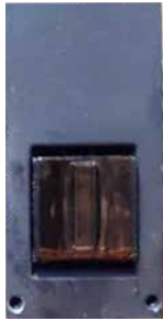
TIJ 2.5 Printhead 12.5mm width