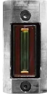
InteliJet LP TIJ 4.0 Printhead 22mm width