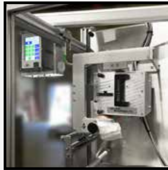
Mounted on a Continuous flow wrapper