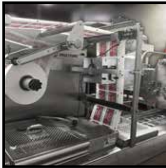
Mounted on an HFFS packaging machine