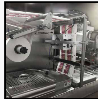
Mounted on an HFFS packaging machine