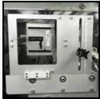
Mounted on a Vertical Bagger